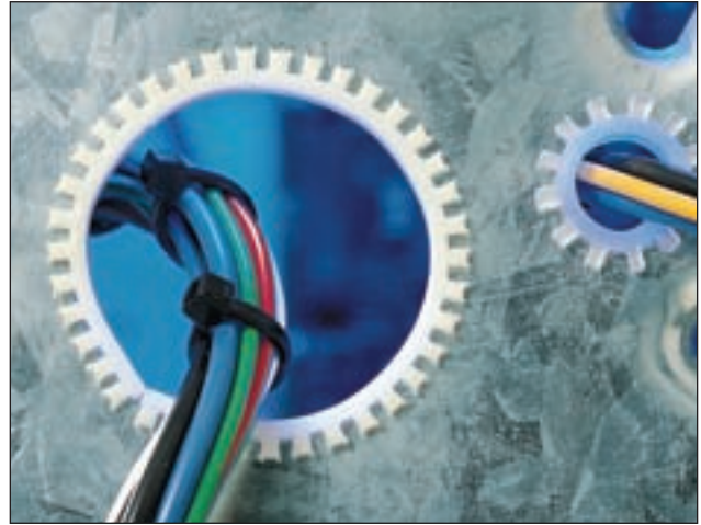
Optimal protection of cables and wires at panel edges.

Flexiform grommet strip is used to protect cables routed through sharp-edged cut-out sections.