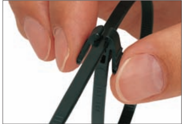
The REZ ties have a one-hand, simple, release mechanism.

These releasable and reusable ties are ideal for temporary installations or the addition and/or removal of cables. Suitable for a multitude of uses, such as the packaging industry as a bag closure where access to part of the bag contents may be needed but the bag needs to be re-sealed (eg. - milk powder in the catering industry).