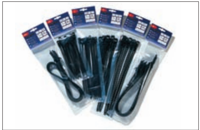
SRT ties available in small quantities.