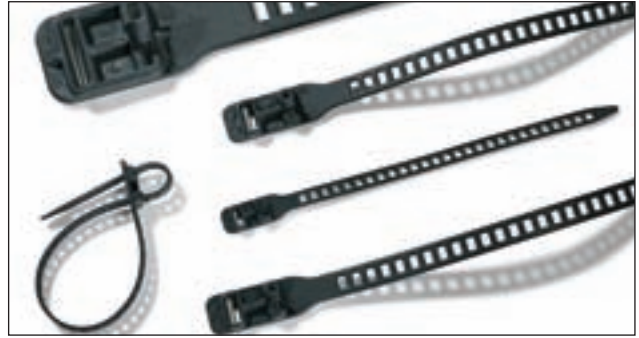
The elasticity of the SRT ties makes them suitable for use in many applications.

The SRT range offers solutions to numerous bundling applications. The soft, flexible material makes these ties particularly suitable for use on data and fibre-optic cables. The elasticity of the material makes them ideal for securing young trees to support poles, and other applications within the gardening and landscaping industry.