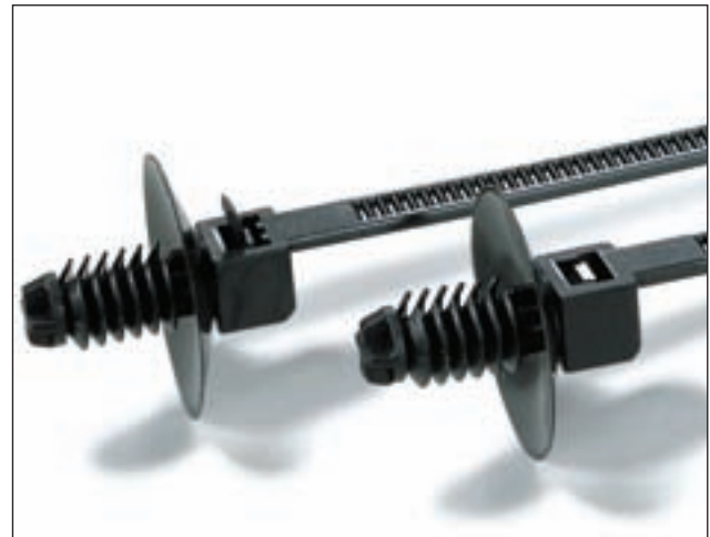
Ideal for use in 'thick' panels and threaded, blind holes.

Primarily designed for fixing cable harnesses in the automotive industry their simplicity and ease of use has resulted in these parts being used in many other industries e.g. aviation, switch-gear manufacture and white goods.