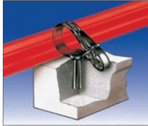
Wall plug tie in application.

Simply drill an 8mm hole and knock in the peg. Used to fasten cables, pipes or hoses in place.