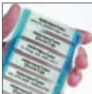
Step 1 Print with thermal transfer printer