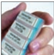
Step 2 Bend liner at side slit