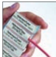
Step 3 Insert wire into marker