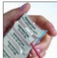
Step 4 Pull-up on wire - the marker will pull away from liner